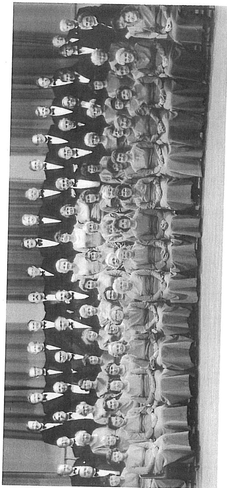
Oldham Choral Society, March 1984