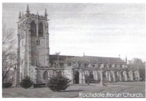
Rochdale Parish Church